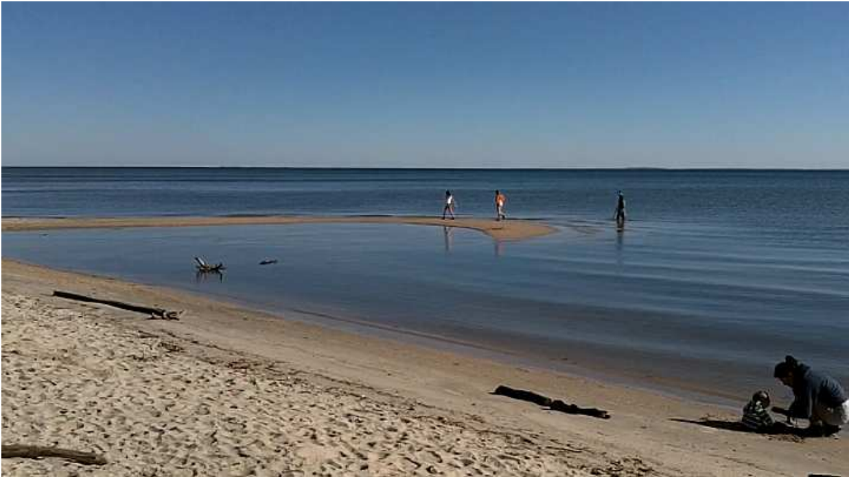
Sunday in the park with gorgeous weather