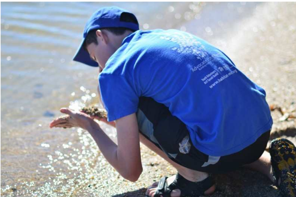
So much to see