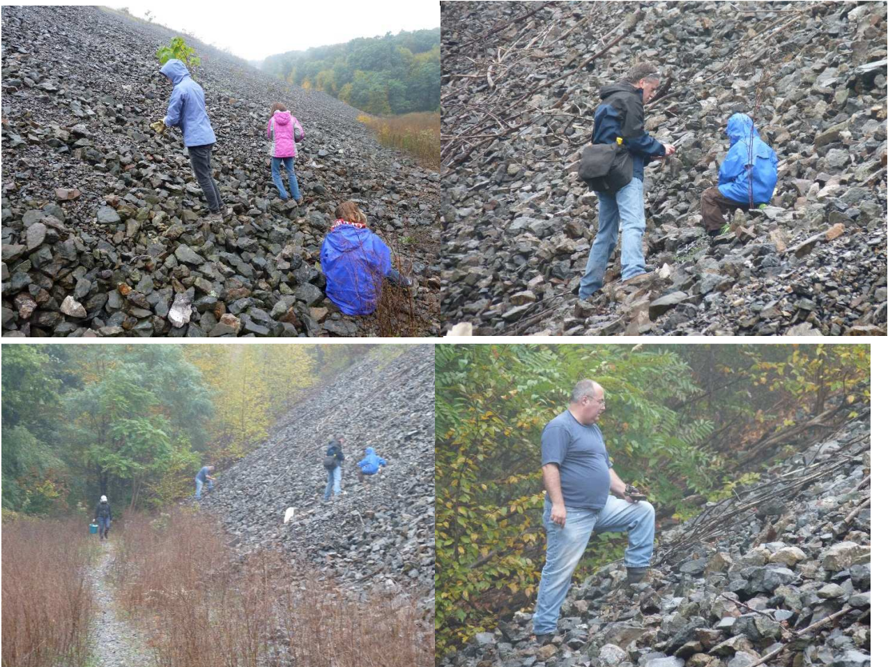
Photos showing collecting at the Cornwall dumps on the steep hillside.

There we searched for vugs with various types of crystals. Much of the rock was a diabase with vugs of a pink feldspar. Other specimens included serpentine, limestone, and conglomerate. At least one member found a specimen with a large mass of stilbite. Others found pyrite, garnet, and green copper minerals forming thin films--likely chrysocolla and malachite.