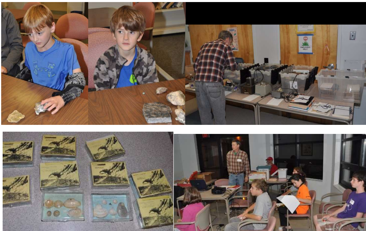
Top row: (Left-right)-mini-miners, mini-miners, equipment auction. Bottom row (Left-right)-fossils shown at MOCKS, Mocks meeting.