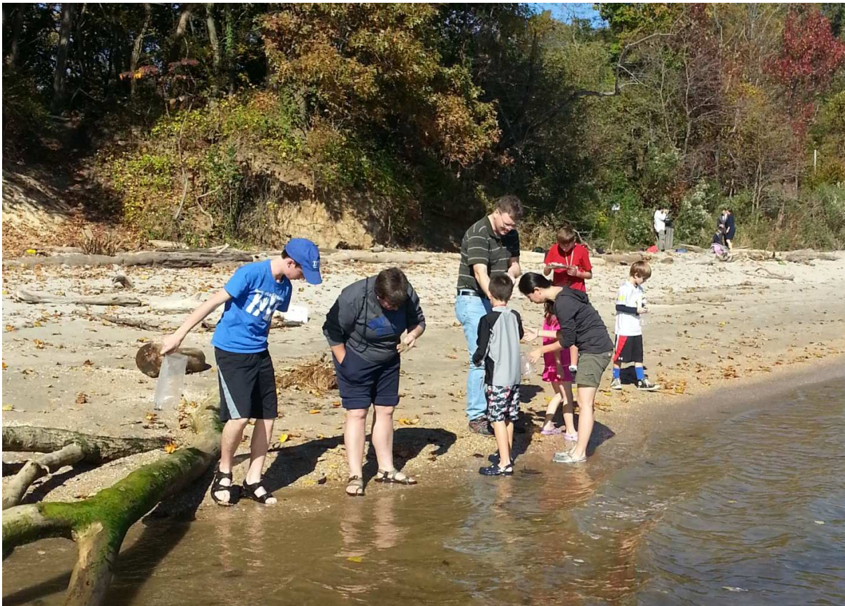
Searching the intertidal zone, aka Chesapeakeing